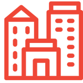
State, District & Local Parties