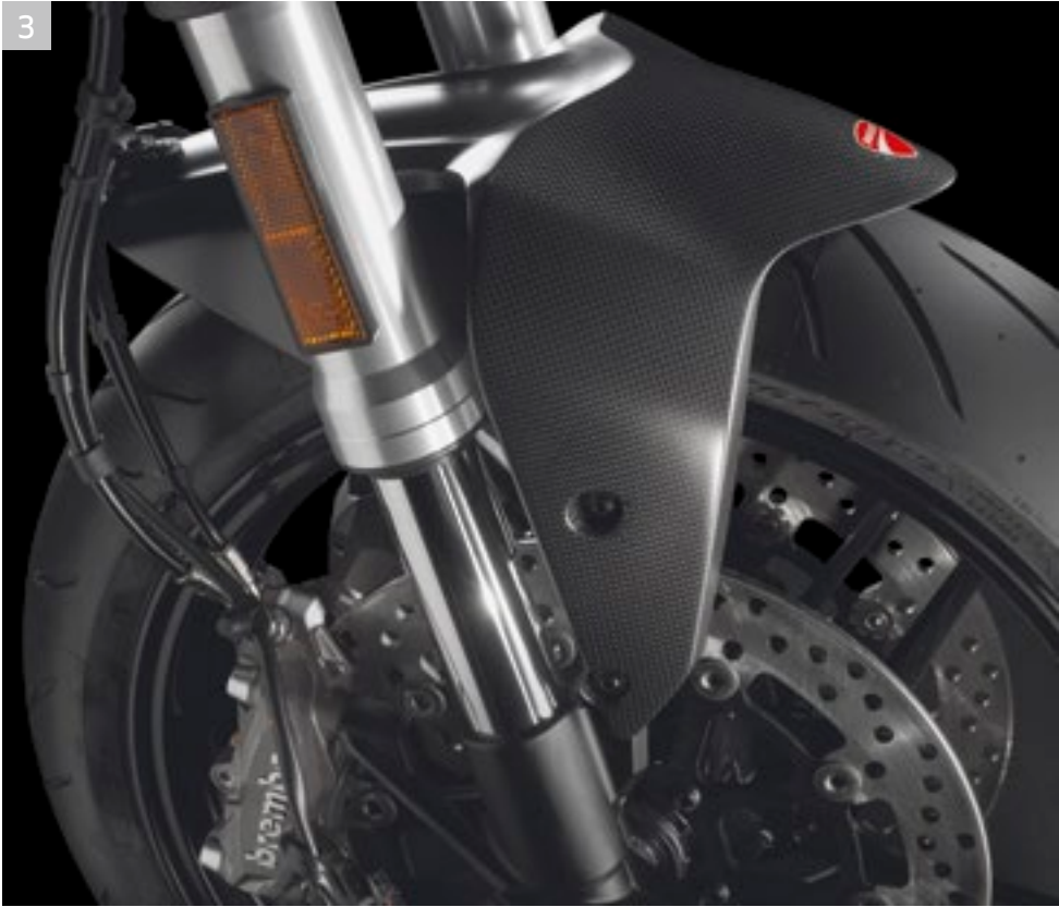
3 Carbon fibre front mudguard