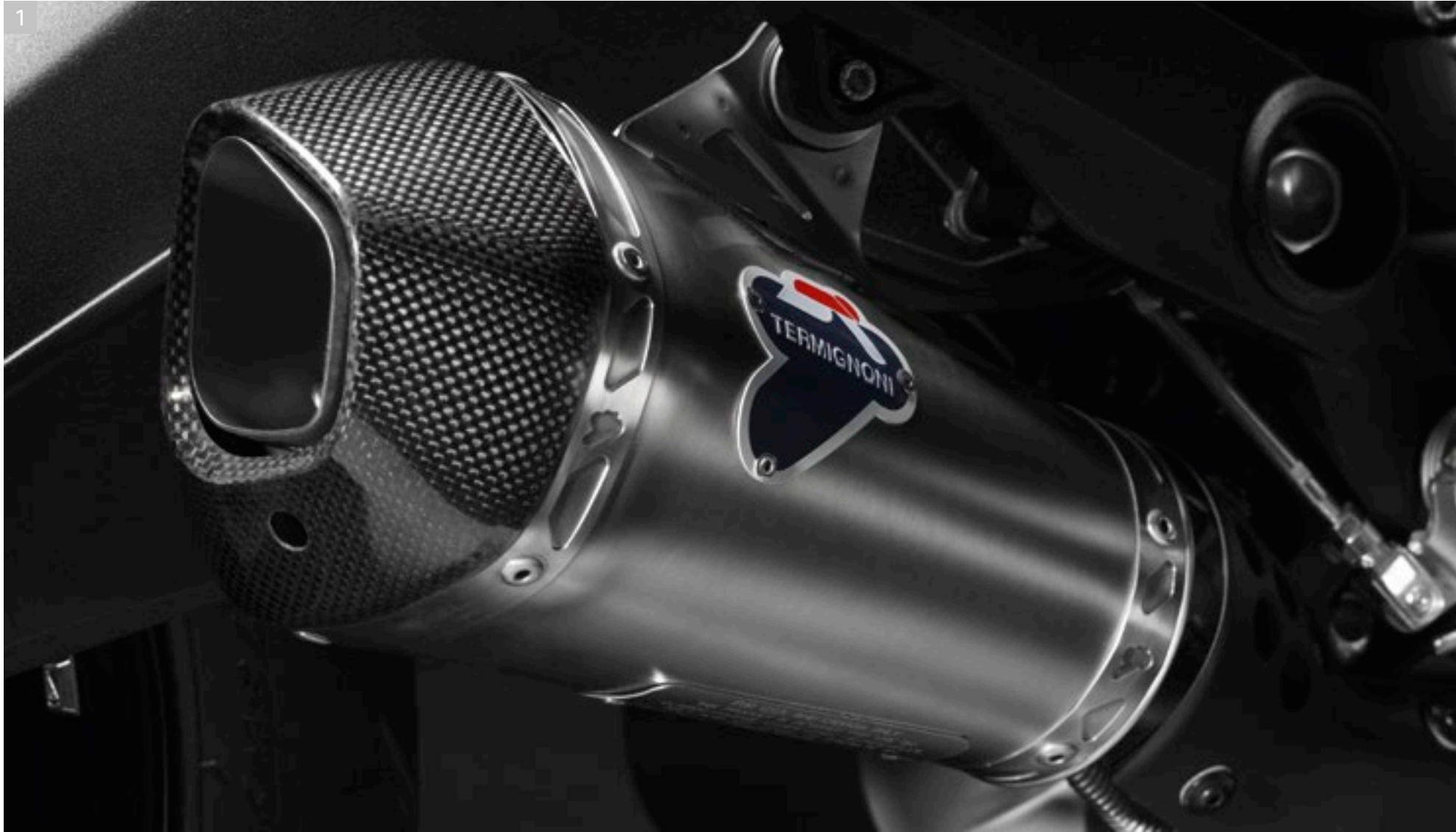
1 Sport-line racing silencer