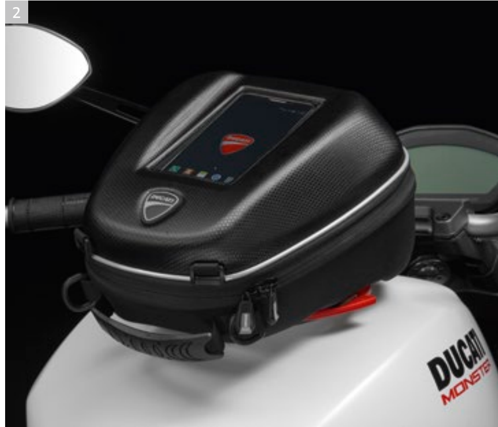
2 Tank pocket bag