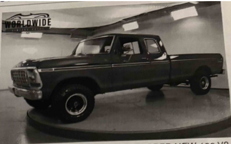
SUPERCAB F150 RANGER EXPLORER NEW 400 V8 AUTOMATIC 4X4 PS PB VINYL BENCH SEATS

Worldwide Vintage Autos is one of the largest classic automobile consignment dealerships in the world. With over 200 vehicles in stock spanning over 80,000 square feet, we have what you are looking for!