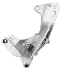
Alternator Bracket (82-93) 5.0/5.8 $79.99