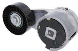
Belt Tensioner (85-93) 5.0L $79.99