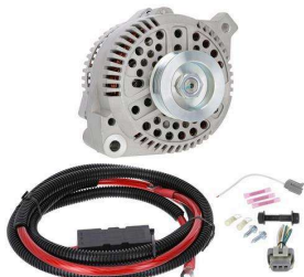
SVE 200 Amp Alternator Full Upgrade Kit (86-93) 5.0/5.8 $314.99