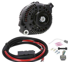
SVE 130 Amp Alternator Full Upgrade Kit - Black (86-93) 5.0/5.8 $279.99