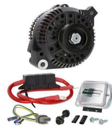
SVE 130 Amp Alternator 1g to 3g Upgrade - Black (79-85) 5.0/5.8 $274.99