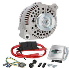
SVE 130 Amp Alternator 3g Upgrade (79-85) 5.0/5.8 $244.99