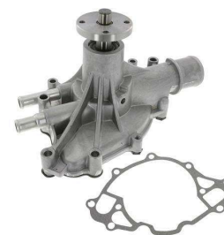
Motorcraft Water Pump (79-93) 5.0 $62.99