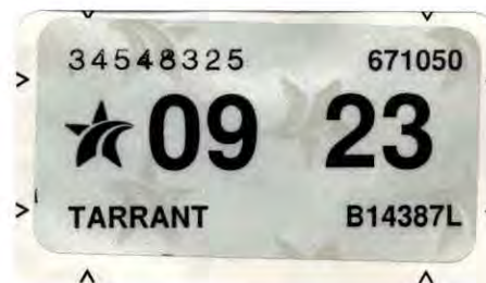
PLATE STICKER / CALCOMANÍA DE PLACA

Peel sticker from any corner. Despegue la calcomanía de cualquier esquina.