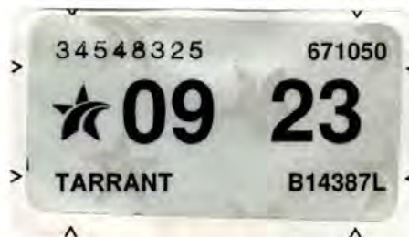
PLATE STICKER / CALCOMANÍA DE PLACA