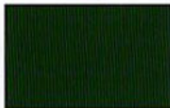
British Racing Green