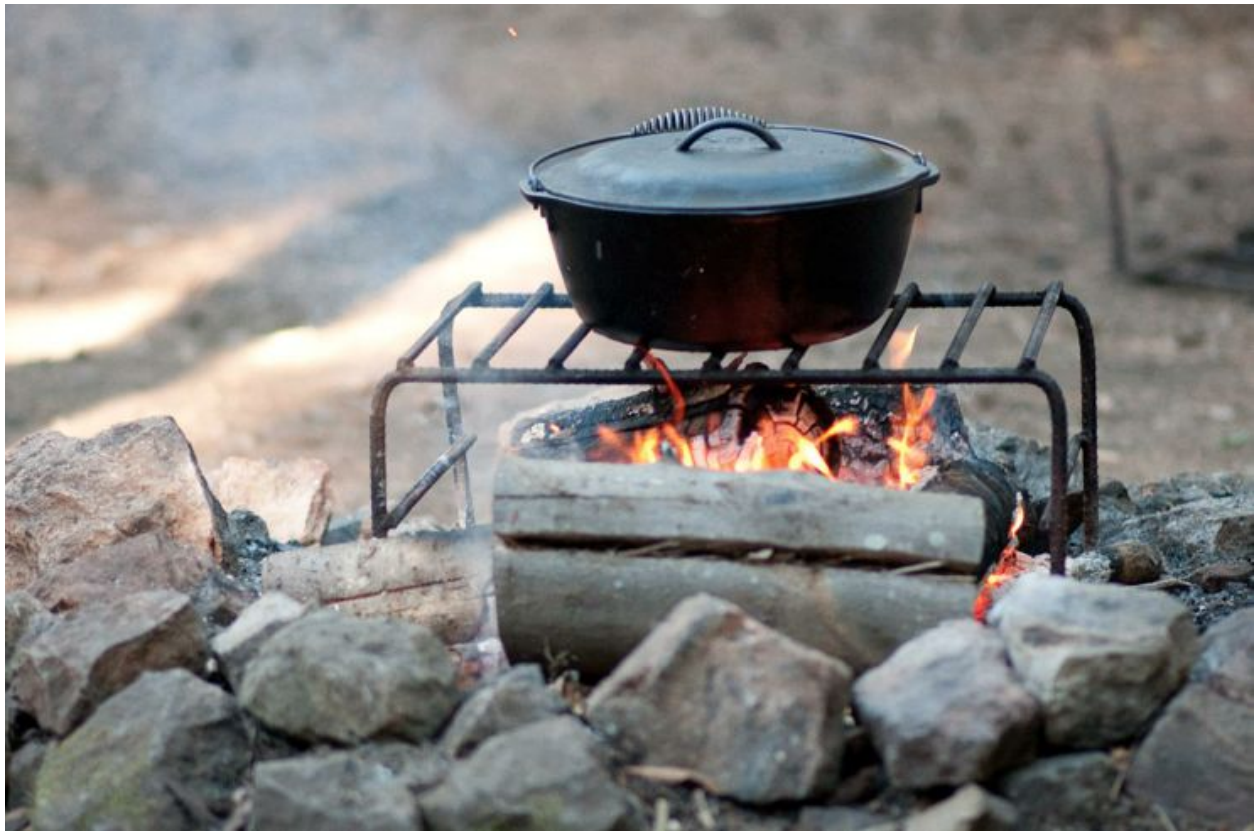
Another delicious dinner, prepared by participants, simmering over the campfire

If your child needs to bring supplemental due to dietary restrictions food please let us know. Because of wildlife concerns we keep all food in our secured storage area so we will need to collect it at drop off.