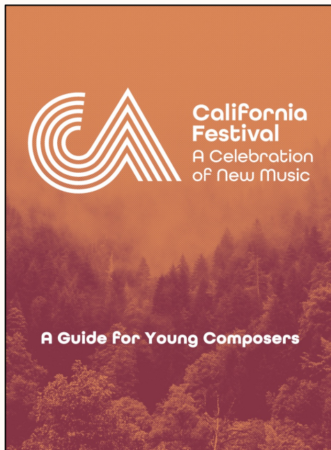
A Guide for Young Composers

Access and download these resources on the CA Festival website .