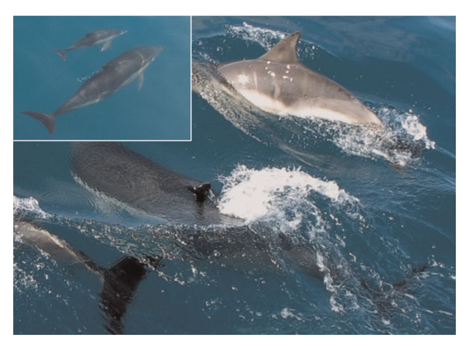
Fig. 3. Photographs showing new born (neonatal) common dolphin calves in the Moray Firth study area recorded in June and July 2009; note the very small size and discernible foetal folds of each of the youngsters in these images.

conservation management strategies alike. New additions to the cetacean community in a particular region might conceivably lead to unexpected competition between sympatric species for common prey or essential habitat (Robinson et al. , 2007; Weir et al. , 2009), whilst range changes may result in unexpected, and therefore unplanned, interactions with human activities (Alter et al. , 2010). Common dolphins are particularly vulnerable to by-catch, for example (de Boer et al. , 2008; Murphy et al. , 2009), and animals progressing north may