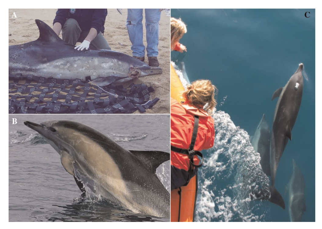
Fig. 2. Photographs of D. delphis recorded by the research teams: (A) shows a 2.19 m deceased adult male recovered by the CRRU veterinary team from Rattray Head, south of Fraserburgh, in May 2005; (B) and (C) show common dolphins sighted during two separate boat encounters in the outer Moray Firth study area. The largest school encountered during the investigation was with an estimated 450+ animals on 22 June 2009 (photographs: Kevin Robinson and Pascal Kriwy/ CRRU).

their distribution accordingly (MacLeod et al., 2007b; MacLeod, 2009). Moreover, historical strandings data infer that a similar, sustained expansion into the British North Sea may have occurred during a separate warm-water period in the 1930s to 1950s (Bakker & Smeenk, 1990, MacLeod et al., in preparation). Whatever the underlying mechanism, however, the occurrence of short-beaked common dolphins in our northern shelf waters is clearly increasing, and this will inevitably have implications for existing cetacean communities and for