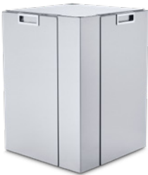
90-Degree Corner Cabinet

DIMENSIONS 36.402 H x 23.727 D ELECTRICAL REQUIREMENTS No