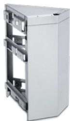
45-Degree Corner Cabinet

Create a custom shape to your outdoor kitchen by utilizing a 45 or 90-degree angle cabinet.