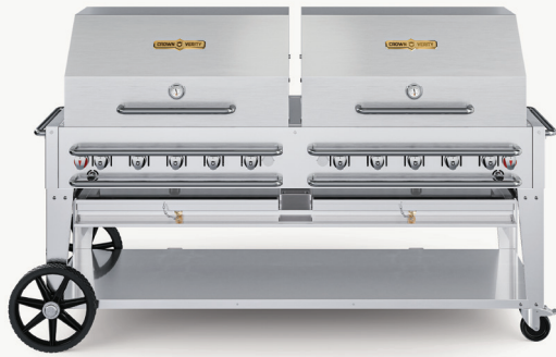
CV-RCB-70RDP model shown