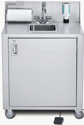
CV-PHS-1 model shown above