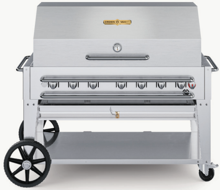
CV-RCB-48RDP model shown