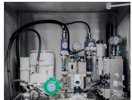
General view inside HPU

Standard supply medium Hydraulic oil Fire resistant fluid version on request