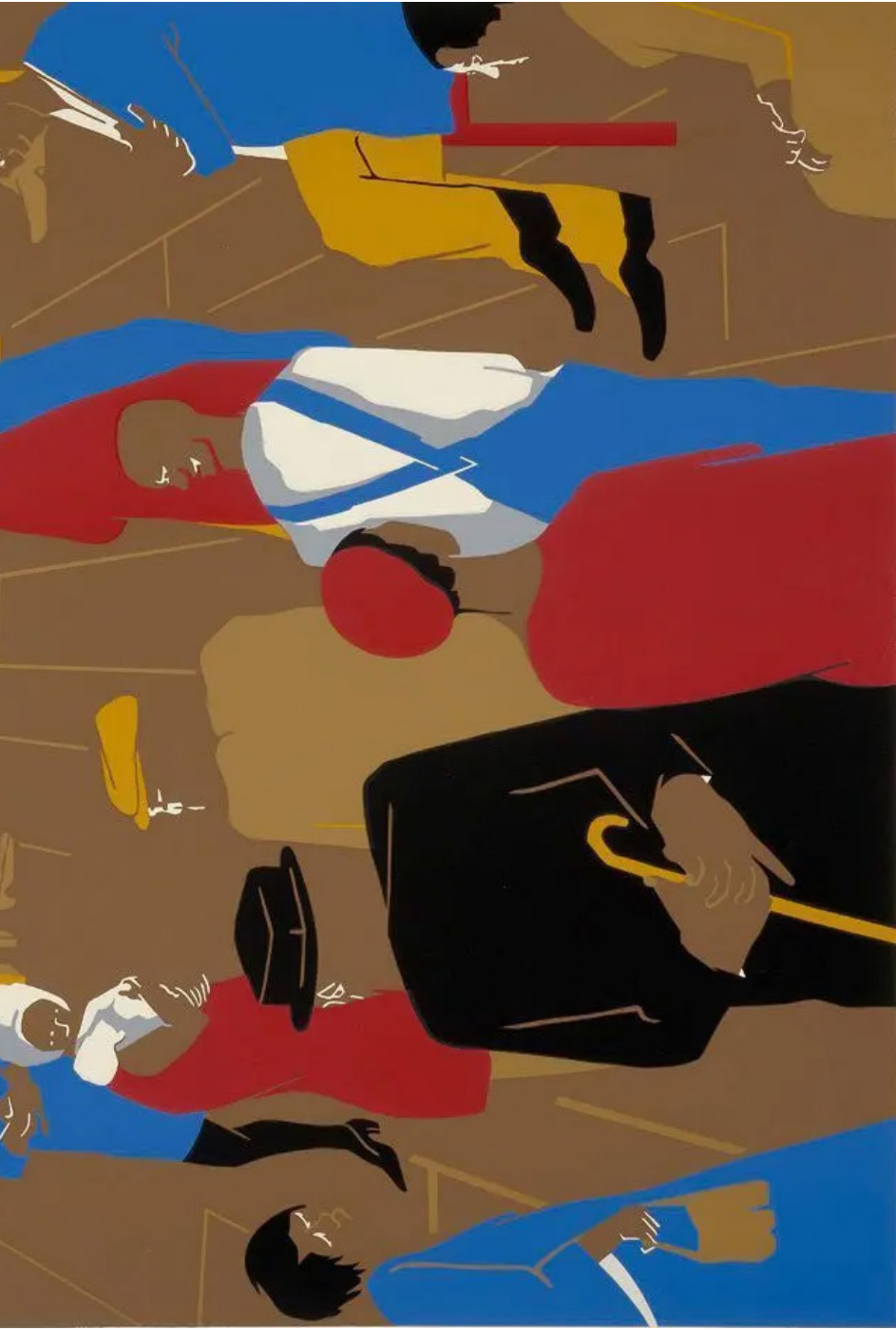
Jacob Lawrence (American, 1917–2000). The 1920's...The Migrants Cast Their Ballots , 1974. Screenprint on paper, 32 x 24 7/8 in. Crocker Art Museum, gift of Lonilard, New York City, 1975.28.8. © 2025 The Jacob and Gwendolyn Knight Lawrence Foundation, Seattle / Artists Rights Society (ARS), New York.