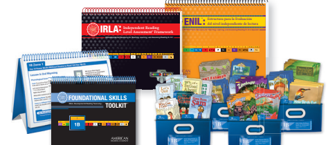
IRLA/ENIL Foundational Skills Toolkits®