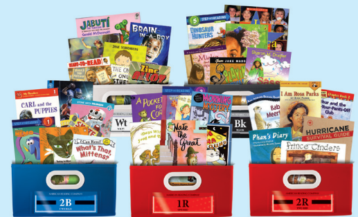
5 Baskets at a Range of Reading Levels (150 Leveled Literary and Informational Titles)

This five-basket set provides an initial start to independent practice in IRLA/ENIL leveled texts. Due to the limited level range and quantity of titles in a five-basket library, most classrooms will need at least twice this many books to support independent reading across a school year.