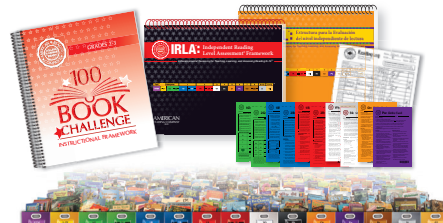
100 Book Challenge®