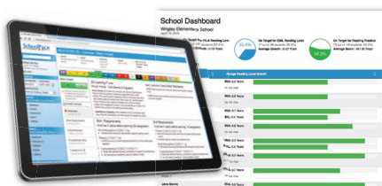
SchoolPace® Annual Subscription