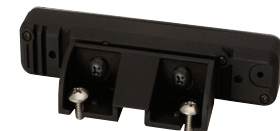
Tilt Bracket / Self-Adhesive