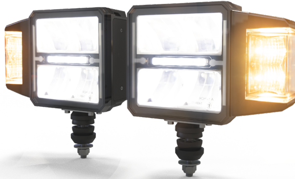
Universal indicator can be mounted on top or sides