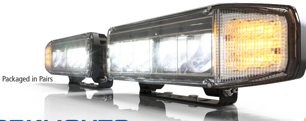
Packaged in Pairs