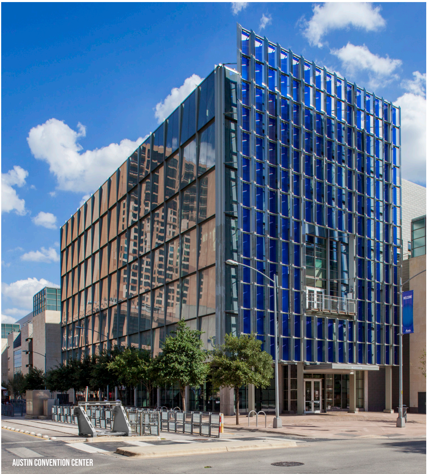
AUSTIN CONVENTION CENTER

“ THIS PLAN WAS COMMISSIONED TO SAFEGUARD THE HEALTH AND WELL-BEING OF OUR CLIENTS, THEIR EVENTS, OUR TEAM MEMBERS AND OUR LOCAL AUSTIN COMMUNITY. ”