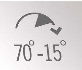
2. Intuitive symbols All symbols used are reduced to their most essential elements, are self-explanatory and have a high recognition factor.