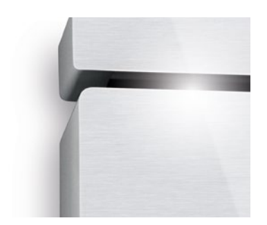
4. Clear design language The XEA design language is based on monolithic structures which are defined by flat, two-dimensional surfaces. Radii and sharp edges are contrasted.