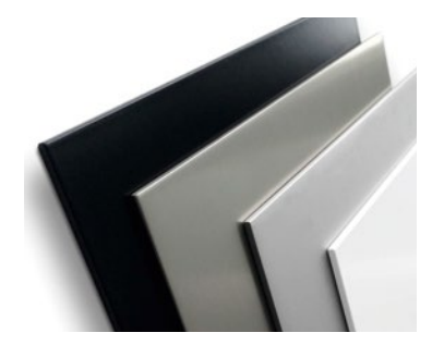
3. Standard surface finishes XEA unifies four standard basic colours, which can be easily combined for all products. The XEA colour numbering system allows different components to be brought together worldwide.