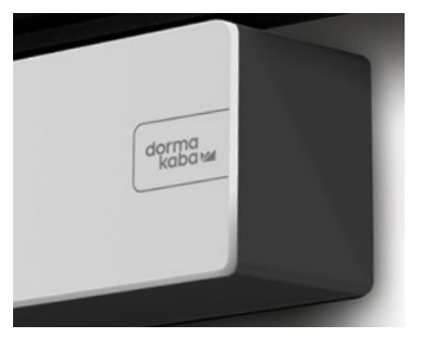
1. Identifiable brand products Each XEA product can be clearly identified as a dormakaba product by features such as our logo on the front of the product.

The XEA design language is based on a comprehensive, standardised position, consistently taking into account our own requirement for compatibility, high quality, innovation, perfection and aesthetics as stipulated in ten points. This all aims to unite basic designs, colours and surface finishes in a single, standardised appearance: XEA combines dormakaba's product and corporate worlds to form a universal design that speaks a recognisable language in terms of content and visual presence.