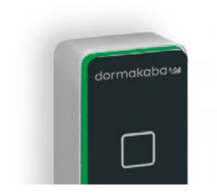
5. Intuitive user interfaces All user interfaces feature a reduced, standardised design, have a high recognition factor and are operated intuitively.