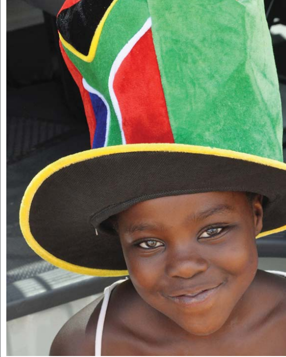
GO MAMELODI 2010