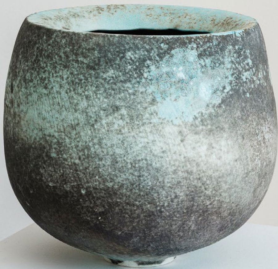
Jack Doherty Folded Rim Guardian Vessel 2022 16 × 20 cm / 6 × 8 in Soda fired porcelain