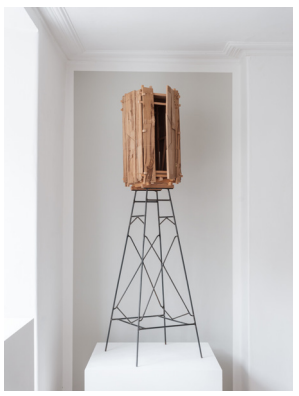
David Gates, 'Threshold III,' 2022