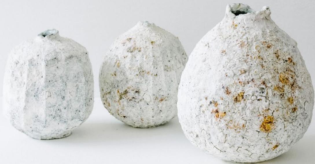
Akiko Hirai Poppy Pod Small 2021 13 × 15 cm / 5.1 × 5.9 in Stoneware