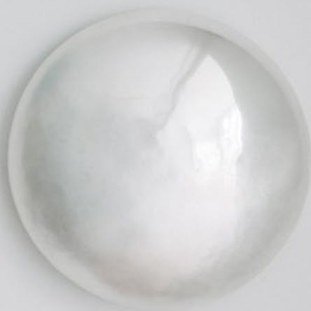
Adi Toch Plump Wall Object 2019 29 × 28 × 8 cm 11.4 × 11 × 3.1 in Britannia silver (hallmarked)