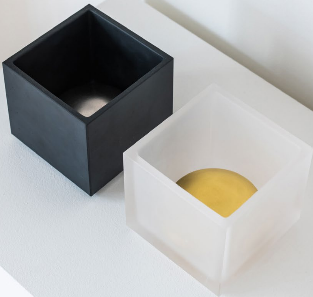
Andrea Walsh Pair of Contained Boxes (Square), A. Black & Platinum, B. Clear & Gold 2018

Each approximately 11.5 × 11.5 × 11.5cm 4.6 × 4.6 × 4.6 in