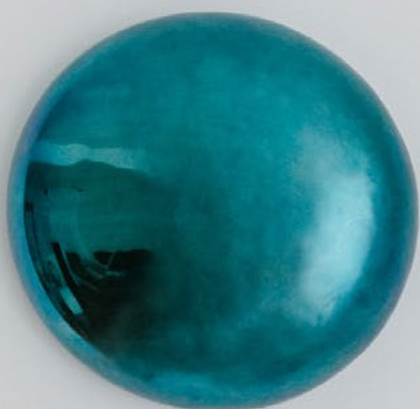
Adi Toch Blue Plump Wall Object 2019 26 × 25 × 8 cm 10.2 × 9.8 × 3.1 in Patinated Britannia silver (hallmarked)