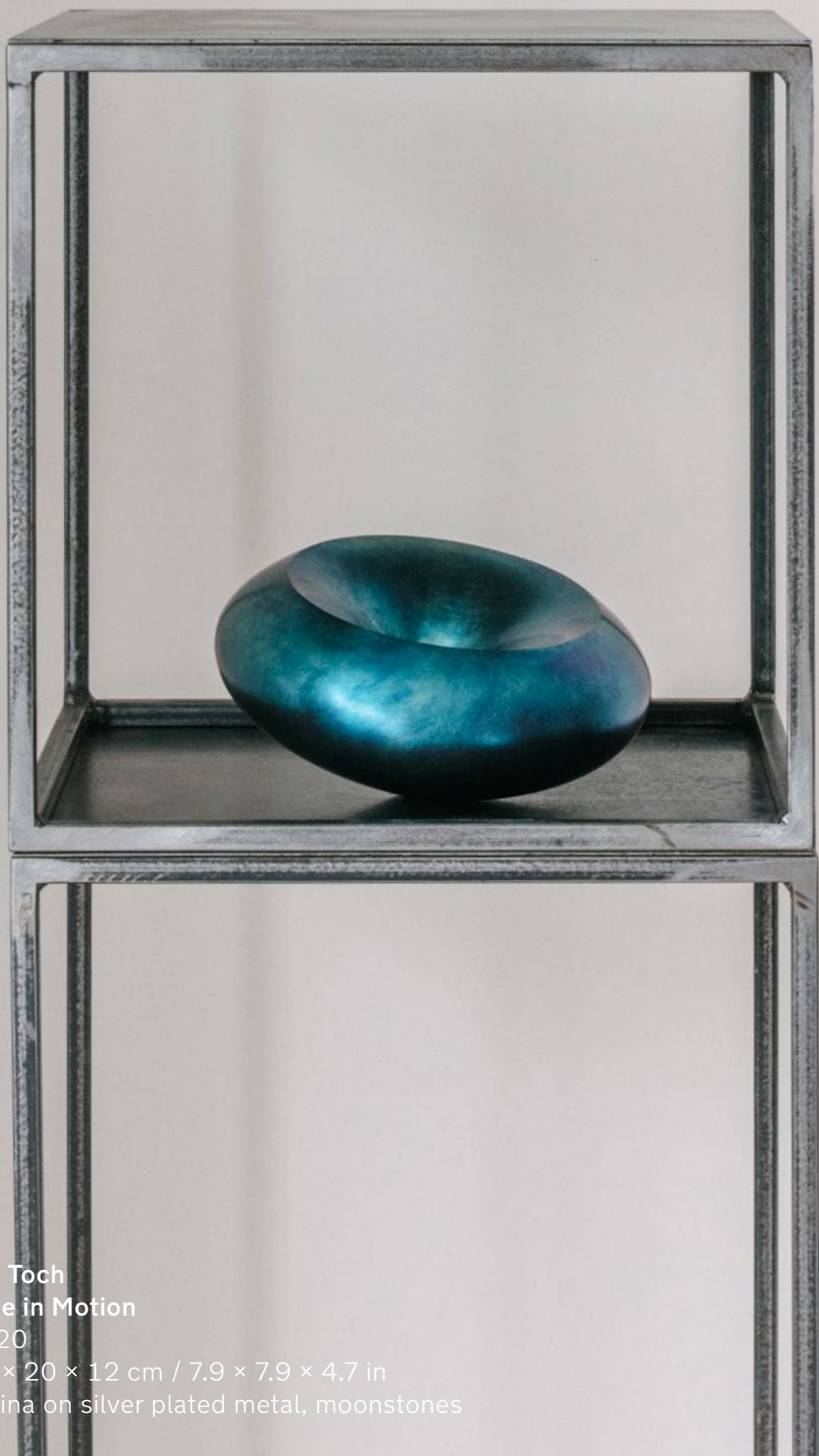
Adi Toch Blue in Motion 2020 20 × 20 × 12 cm / 7.9 × 7.9 × 4.7 in Patina on silver plated metal, moonstones