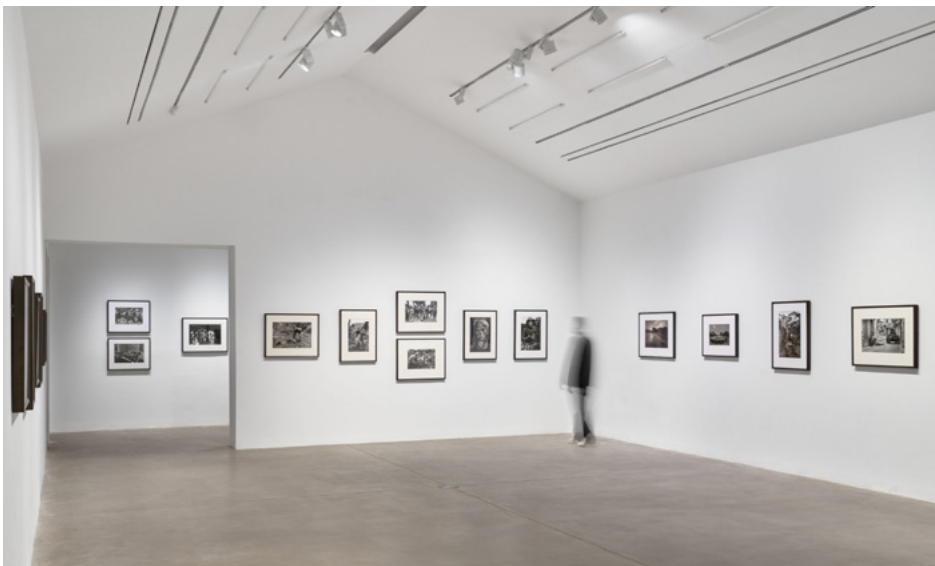
Installation view, 'Don McCullin. 90,' Hauser & Wirth Somerset, 2026

In 1993, McCullin was the first photojournalist to be made a Commander of the British Empire (CBE) and in 2017 he was knighted in the New Year Honours for his lifetime services to photography. In 2025, McCullin celebrated his 90th birthday and received the University of Oxford's Bodley Medal for his outstanding contribution to photography and journalism.