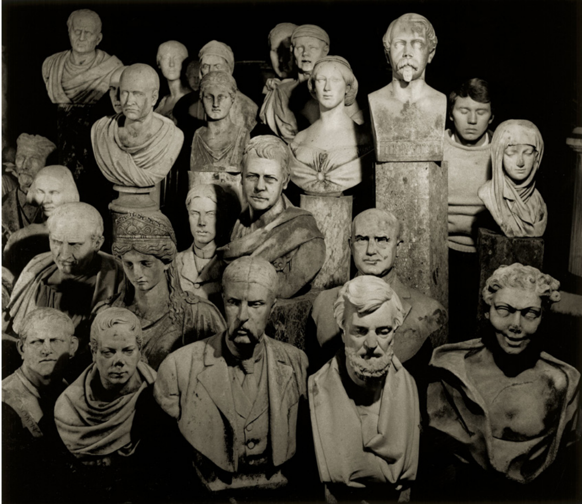
Don McCullin, Self-portrait in Crowthers Reclamation Yard, Isleworth, 1961