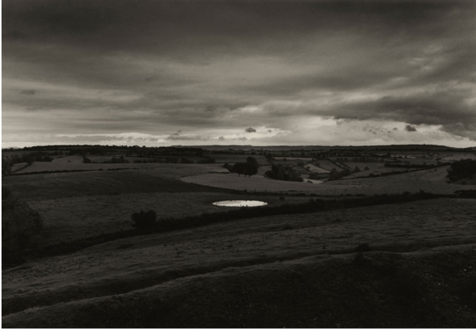
Don McCullin, Dew Pond By Iron Age Hill Fort, Somerset, 1988