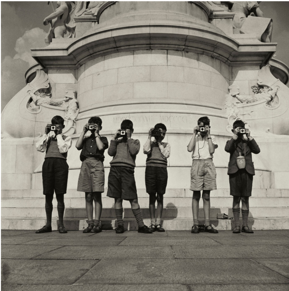
Don McCullin, Outside Buckingham Palace, London, 1960

For the last three decades, McCullin has sought to relieve the horrors of what he has witnessed throughout his career by turning to the land around him. In 1972, he returned to live in the Somerset area of the UK, where he had been evacuated to as a child during the Blitz in the Second World War. He often refers to the sweeping rural landscape as his greatest salvation, which his photographs capture in dramatic, painterly representations. At home, McCullin has developed a series of meticulously constructed still lifes that provide a deeper form of escapism, drawing inspiration from the great Flemish and Dutch Renaissance masters.