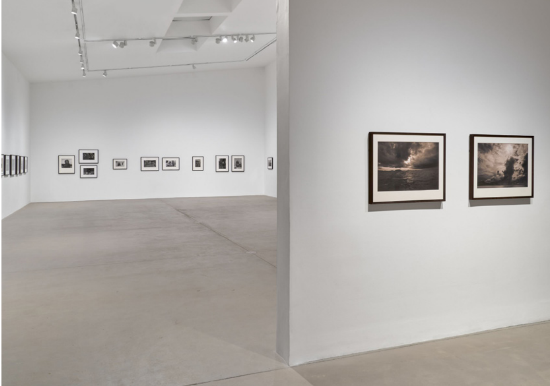
Installation view, 'Don McCullin. 90,' Hauser & Wirth Somerset, 2026 © Don McCullin. Photo: Theo Niderost