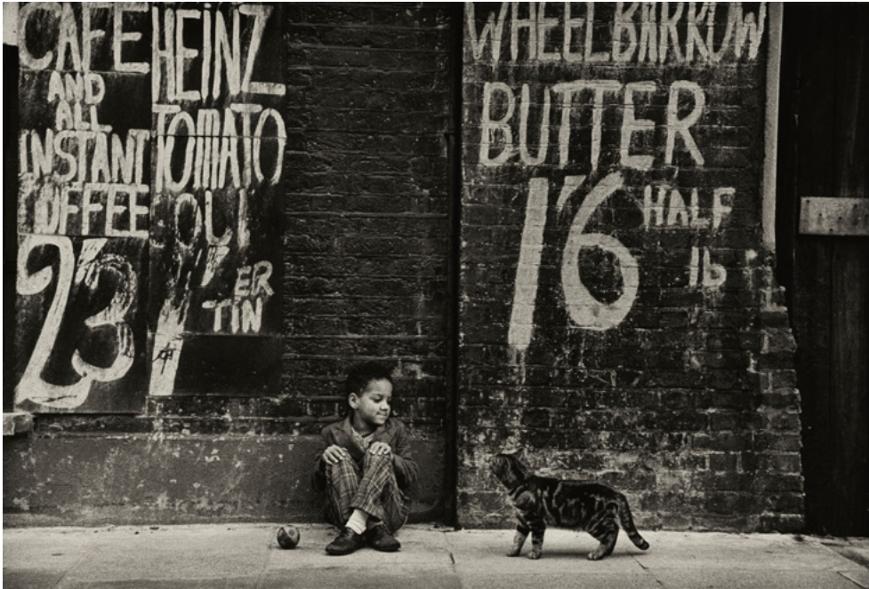
Don McCullin, Hessel Street, Jewish District, East End, London, 1962