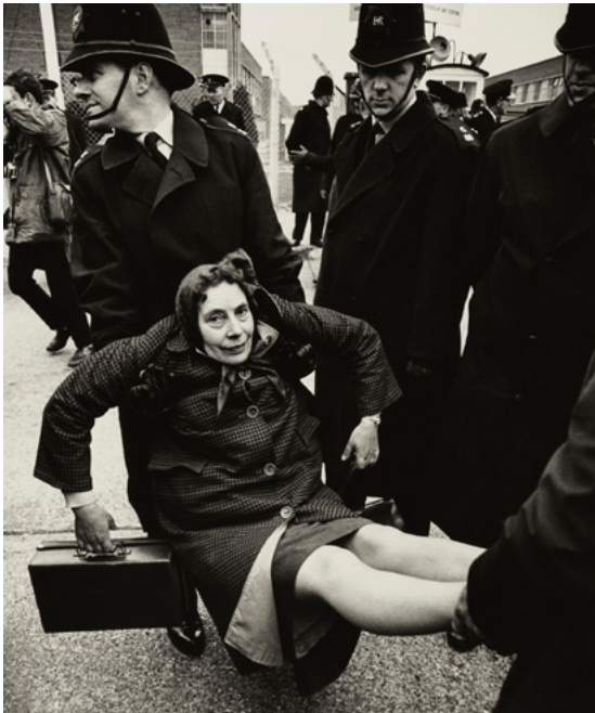
Don McCullin, Ban The Bomb March, Aldermaston, 1960

'The joy of travel is in the discovery of the unexpected and those serendipitous, surprising encounters with different cultures unlike our own.' — Sir Don McCullin CBE