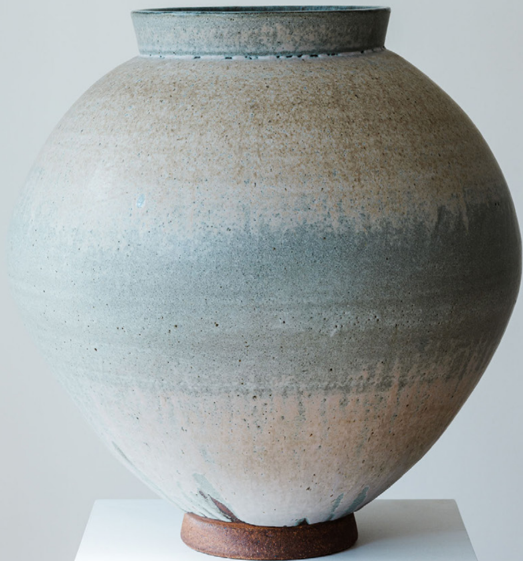
Adam Buick Jar, Large (Stoneware with straw ash glaze and interior) 2021 49 cm / 19.3 in Stoneware with straw ash glaze and Nuka glaze interior)