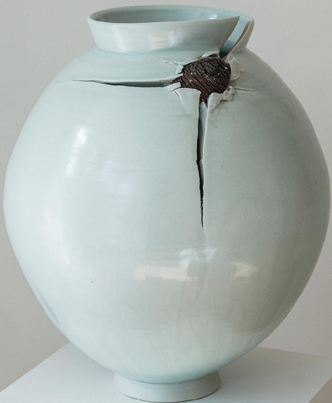
Adam Buick Jar (porcelain with slate pebble inclusion) 2021 46 cm / 18.1 in Porcelain with slate pebble inclusion