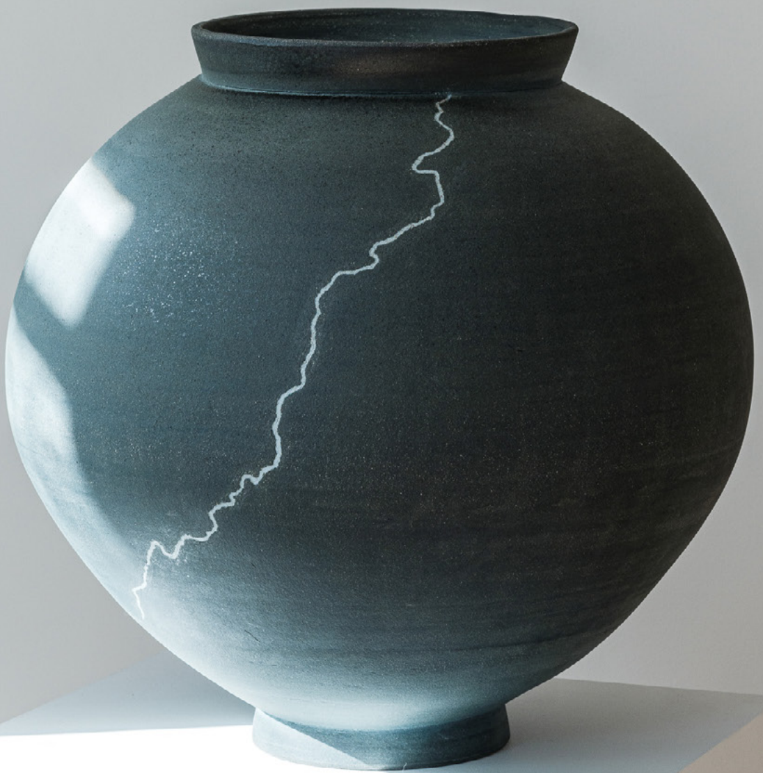
Adam Buick Jar (Coloured Stoneware and inlaid porcelain) 2021 35 cm / 13.7 in Coloured Stoneware and inlaid porcelain