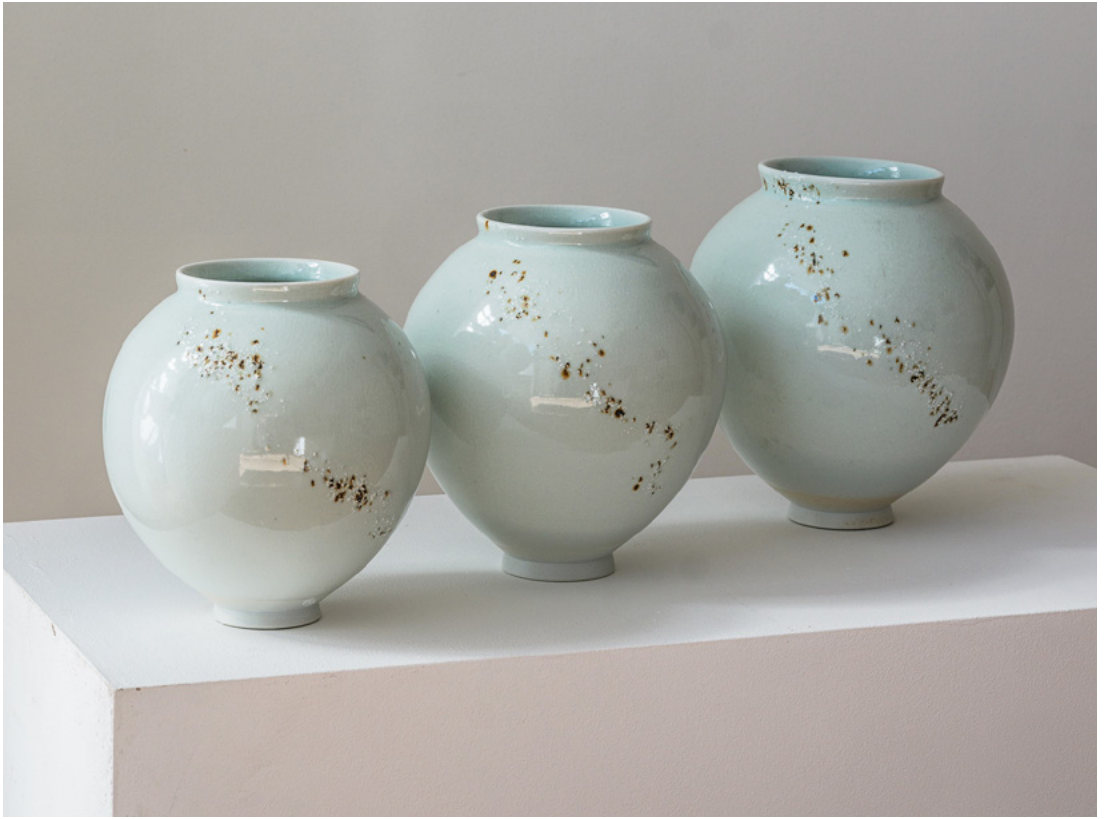
Adam Buick Small Jar Triptych 2021 20 cm / 7.9 in each Porcelain with quartz path