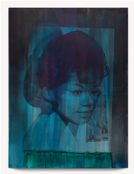
Lorna Simpson, 'Blue Tulip,' 2023

In a nod to the gallery's heritage, a grouping of works by Swiss artists such as Günther Förg , Hans Emmenegger , Irène Zurkinden and the German-Swiss Meret Oppenheim are also on display. Other European greats include Niki de Saint Phalle —who, along with Louise Bourgeois, is featured in 'Racines' at Fondation Opale in Lens, Switzerland, until 12 April 2026— Eugène Carrière and Giorgio Morandi .