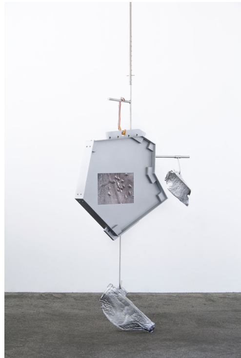
Nairy Baghramian, 'S'accrochant (rouan),' 2024