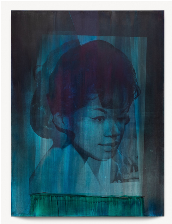
Lorna Simpson, 'Blue Tulip,' 2023

Alongside further works by Swiss artists such as Günther Förg and Hans Emmenegger , Irène Zurkinden and the German-Swiss Meret Oppenheim beyond the gallery's roster. Other European greats include Niki de Saint Phalle —who, along with Louise Bourgeois, is featured in 'Racines' at Fondation Opale in Lens, Switzerland, until 12 April 2026— Eugène Carrière and Giorgio Morandi .