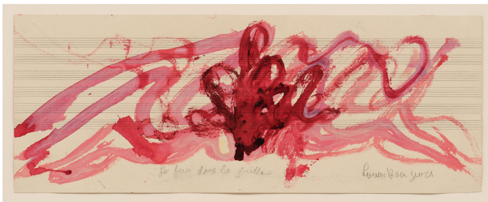
Louise Bourgeois, 'Le feu dans la grille,' 2007 – 2008

Our booth at Art Genève will showcase the gallery's multigenerational program and beyond, whilst celebrating forthcoming institutional shows from our diverse family of artists. The selection includes paintings, sculptures, works on paper and more by both contemporary and modern masters.