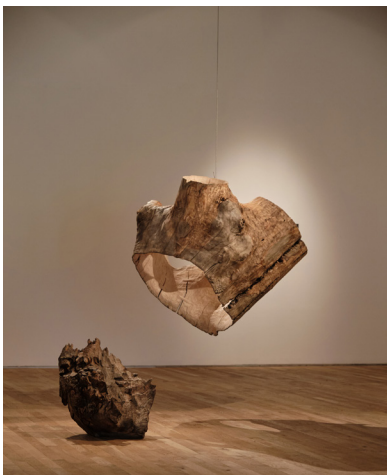
Max Bainbridge, 'Heartwood I,' 2024

Make Hauser & Wirth is a dedicated space for contemporary making and the crafted object, committed to showcasing some of the world's best emerging and established artist-makers. Make is a natural extension of the wider Hauser & Wirth gallery ethos, embracing art, craft, gardens, food and architecture. Since launching in 2018 in Somerset, UK, Make has presented work by over eighty artist-makers and provided valuable insights into material-led processes and the rich narratives of their practices. Works exhibited by Make embrace material truth, provenance, sustainability and the value of emotional engagement with the handmade. In addition to a varied exhibition program, Make has hosted practical workshops, discussions and studio visits to expand learning and engagement with makers and global craft organisations.