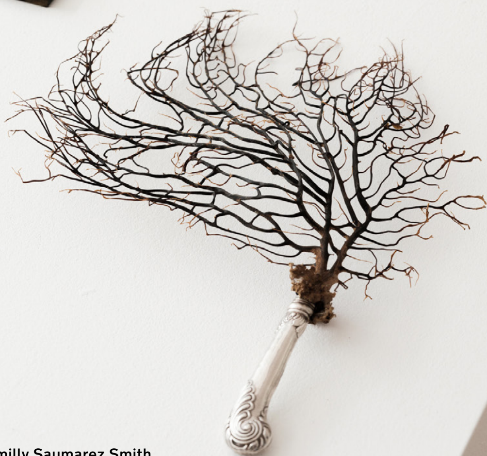
Small Treehandle I

Ammonite part fossilised in agate, silver, 9 carat gold