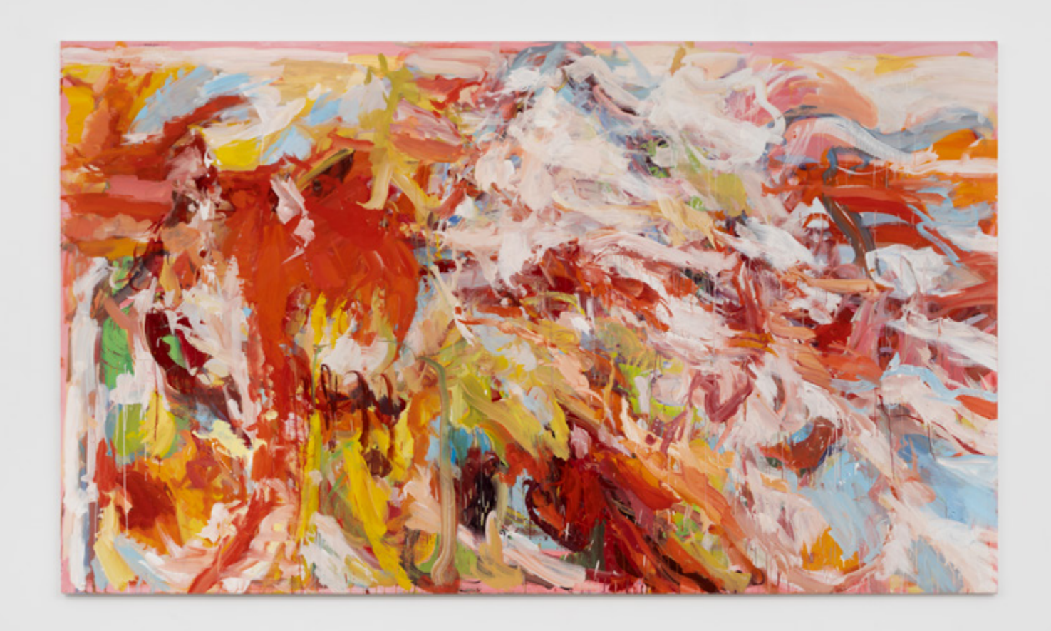
Catherine Goodman, Sasha, 2023, Oil on canvas

a kaleidoscopic mesh. By contrast, Scarlet Shig evokes a dense thicket of undergrowth and a welter of vivid detritus projected heavenward. Somerset recalls the landscape of the title: rain-soaked fields animated with bursts of soft pinks and yellows and hints of old bark. There are layers here that run deep into the earth and shoot up to the stars. It's at once abstract, a landscape, a state of mind, a view.