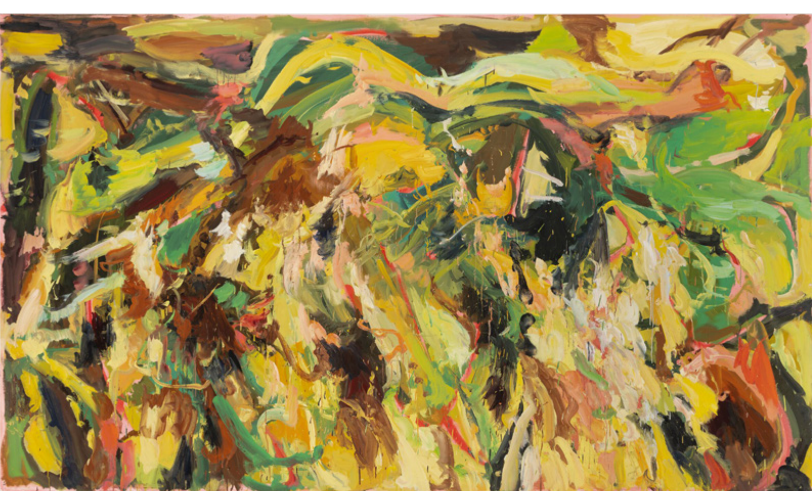
Catherine Goodman, Somerset, 2023, Oil on canvas

Catherine Goodman's monumental new paintings 1 All quotes recorded by Jennifer Higgie at Catherine conjure landscapes and seascapes and states of mind: turbulent one moment, calm the next, impossible to summarise. For decades she's been described as a figurative artist, and her move into abstraction has resulted in a sustained rush of energy, which emerges in swift, swirling colours, tangled reveries and flashes of light as fresh as dawn. The titles of these recent works - such as Sing While You Sleep, Night Beekeeper II, The Land of Lapis Angels (all works 2023) - privilege mood and evocation over blunt explanation. While the artist is wary of too much narrative – she wants the paintings to work within their own logic and is open to different readings of them - Goodman sees the titles as being helpful; a kind of 'doorway for people to walk through'.1