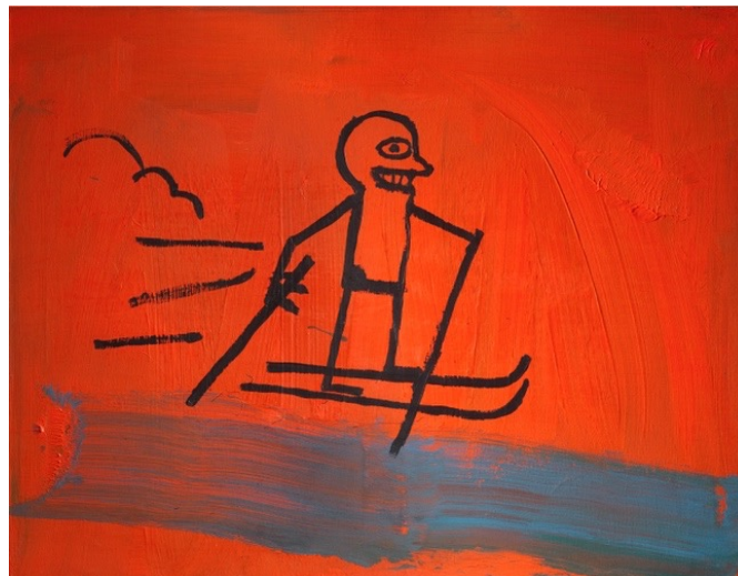
Jean-Michel Basquiat, Skifahrer (Skier), 1983 © Estate of Jean-Michel Basquiat. Licensed by Artestar, New York. Collection Carmignac