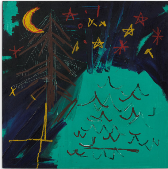
Jean-Michel Basquiat, 'See (Lake)', 1983 © Estate of Jean-Michel Basquiat. Licensed by Artestar, New York. Courtesy Private Collection

Integrating the immediate world around him with his varied encyclopaedic knowledge, 'Big Snow' (1984) sees Basquiat once again processing his impressions of the Engadin in conjunction with themes relating to race and Black history, combining motifs of the Swiss mountains, snow and skiing with the Berlin Olympic Games of 1936 and Jesse Owens' win of four gold medals. In 1985, Basquiat would go on to be part of a group show at the Segantini Museum in St. Moritz, showcasing his work 'See (Lake)' (1983) in an exhibition titled 'The Engadine in Painting'. The latest body of work on view includes a group of monochrome paintings titled 'To Repel Ghosts' which Basquiat created in 1986 during his time in Zurich and St. Moritz, exploring themes of emptiness as well as spirituality in relation to the African Diaspora. Musing on what kept drawing the artist back to Switzerland, Buchhart writes, 'For Basquiat, the Engadin meant work, inspiration, friendship, and rest and relaxation, all at the same time.'