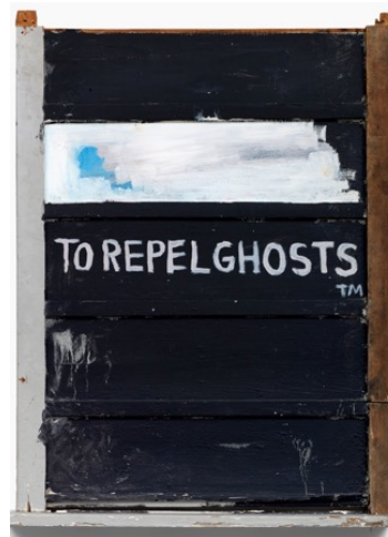
Jean-Michel Basquiat, 'To Repel Ghosts', 1986 Nicola Erni Collection.