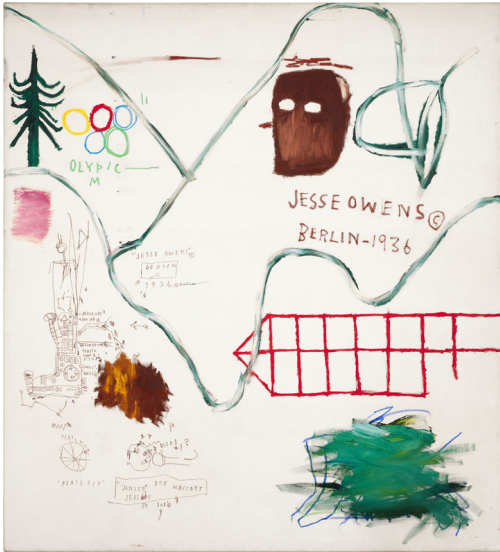
Jean-Michel Basquiat, 'Big Snow', 1984 Private Collection