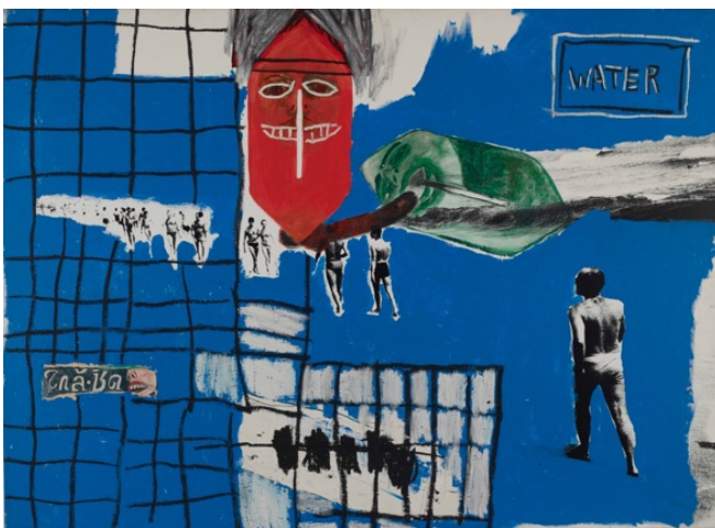
Jean-Michel Basquiat / Andy Warhol / Francesco Clemente, 'In Bianco', 1984