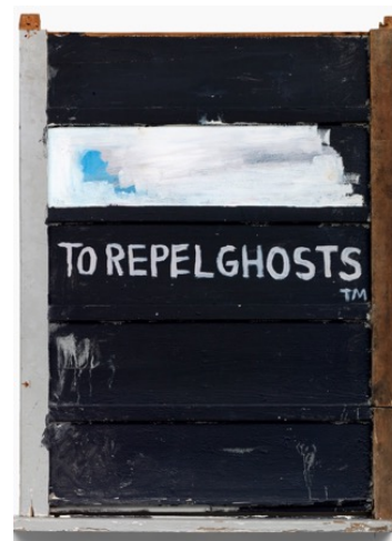
Jean-Michel Basquiat, 'To Repel Ghosts', 1986 © Estate of Jean-Michel Basquiat. Licensed by Artstar, New York. Nicola Erni Collection.

For additional information, please contact: