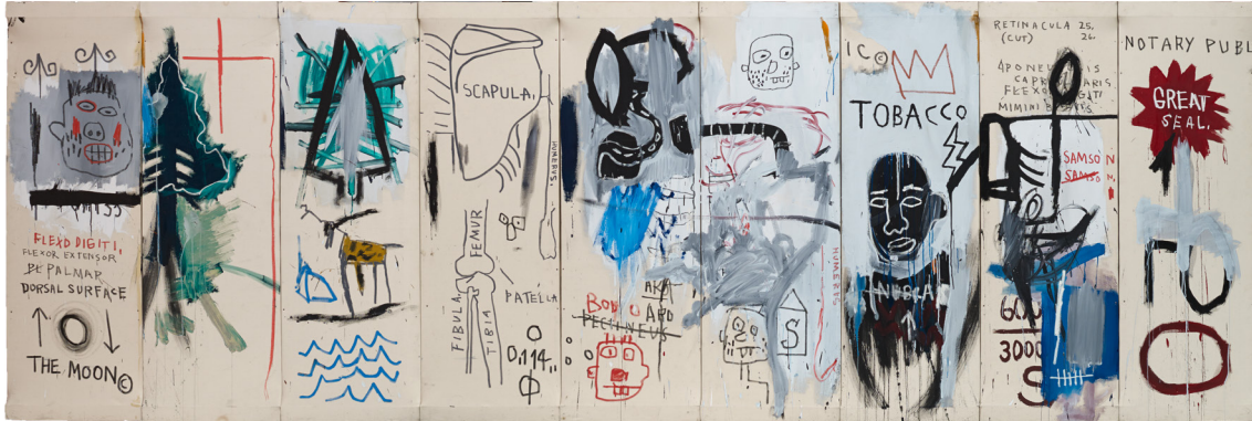
Jean-Michel Basquiat, 'The Dutch Settlers', 1982 © Estate of Jean-Michel Basquiat. Licensed by Artestar, New York. Nicola Erni Collection.