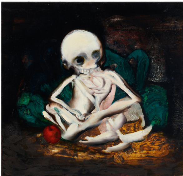
Ambera Wellmann, 'Skellein', 2024