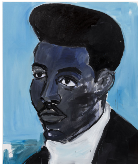
Henry Taylor, 'Blue Period', 2023