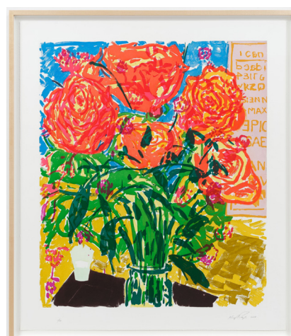
Henry Taylor, I Love Looking at You, 2024