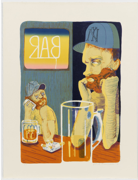
Nicole Eisenman, Bar, 2012