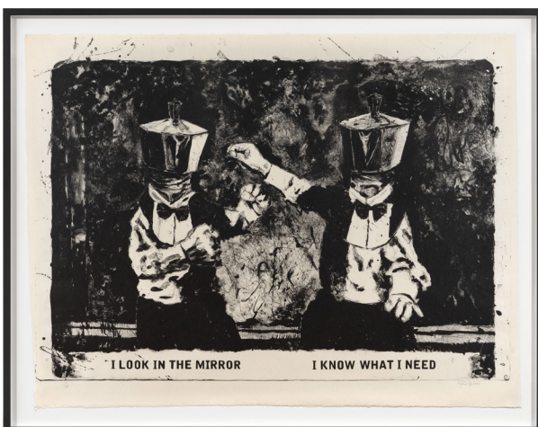
William Kentridge, I Look In The Mirror, I Know What I Need, 2024

US artist Rashid Johnson debuts 'Untitled (Surrender)' (2023), a large silk screenprint which has been newly released by Hauser & Wirth and Brand X Editions. Part of the artist's Surrender series, the large print features ghostly white faces which trace the development of his renowned Anxious Men series. The presentation also brings to London for the first time a selection of Henry Taylor's etchings, first shown at the gallery's editions space in New York earlier this year, including the self-portrait 'Fade to Black, I Did Not Pay the Electric Bill' and still life 'I Love Looking at You' (2024).