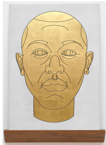
Thomas J Price, Rood Boy (Untitled 2) , 2024

Hauser & Wirth is pleased to return to LOPF with an exceptional selection of works reflecting the gallery's commitment to prints and editions. Featuring works by both contemporary and modern artists from the gallery's roster, the booth highlights the importance of printmaking to the artists' multifaceted practices and celebrates the collaborations between artists and master printers. The fair presentation complements the gallery's ongoing work with printmaking, which is headquartered in a dedicated Editions space on 18th Street in New York.