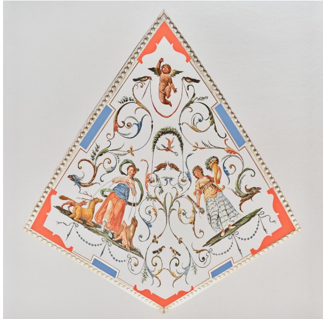
Sonia Boyce, She is Benevolent, 2024