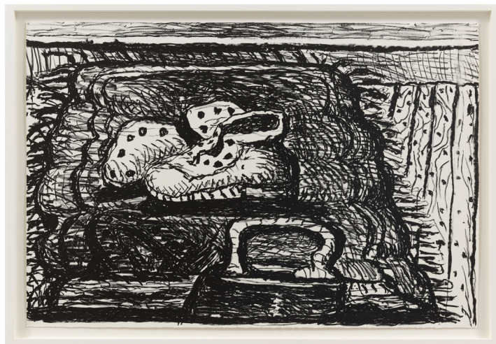
Philip Guston, Rug, 1980

Complementing the gallery's contemporary offering, the booth highlights historic works by modern masters. Philip Guston's 'Rug' (1980) depicts the groundbreaking figurative style which defines the artist's late works and the recurring symbolic motif of shoes. The booth also includes a selection of prints by Takesada Matsutani from the 1960s – 1970s—during which time he worked at Atelier 17 in Paris, Stanley William Hayter's printmaking studio. Additional 20th-century highlights include prints by Dieter Roth, Günther Förg and Eduardo Chillida.