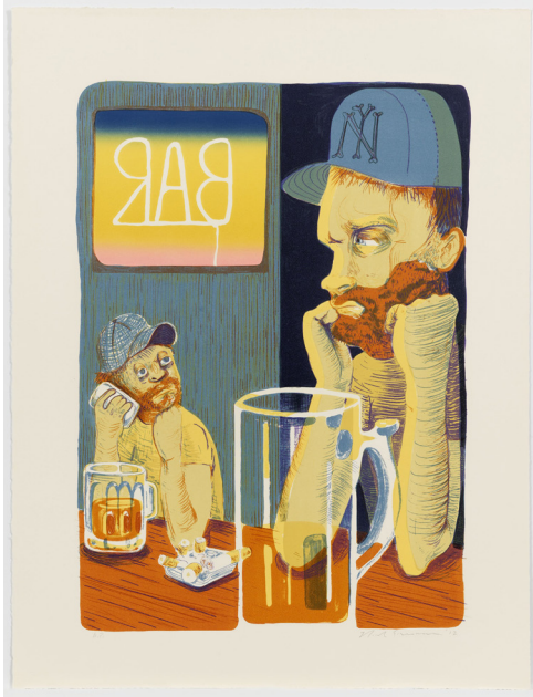
Nicole Eisenman, Bar, 2012