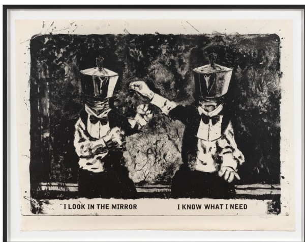
William Kentridge, I Look In The Mirror, I Know What I Need , 2024

US artist Rashid Johnson debuts ' Untitled (Surrender) ' (2023), a large silk screenprint which has been newly released by Hauser & Wirth and Brand X Editions. Part of the artist's Surrender series, the large print features ghostly white faces which trace the development of his renowned Anxious Men series. The presentation also brings to London for the first time a selection of Henry Taylor's etchings, first shown at the gallery's editions space in New York earlier this year, including the self-portrait ' Fade to Black, I Did Not Pay the Electric Bill ' and still life ' I Love Looking at You ' (2024), printed and published by Paulson Fontaine Press.