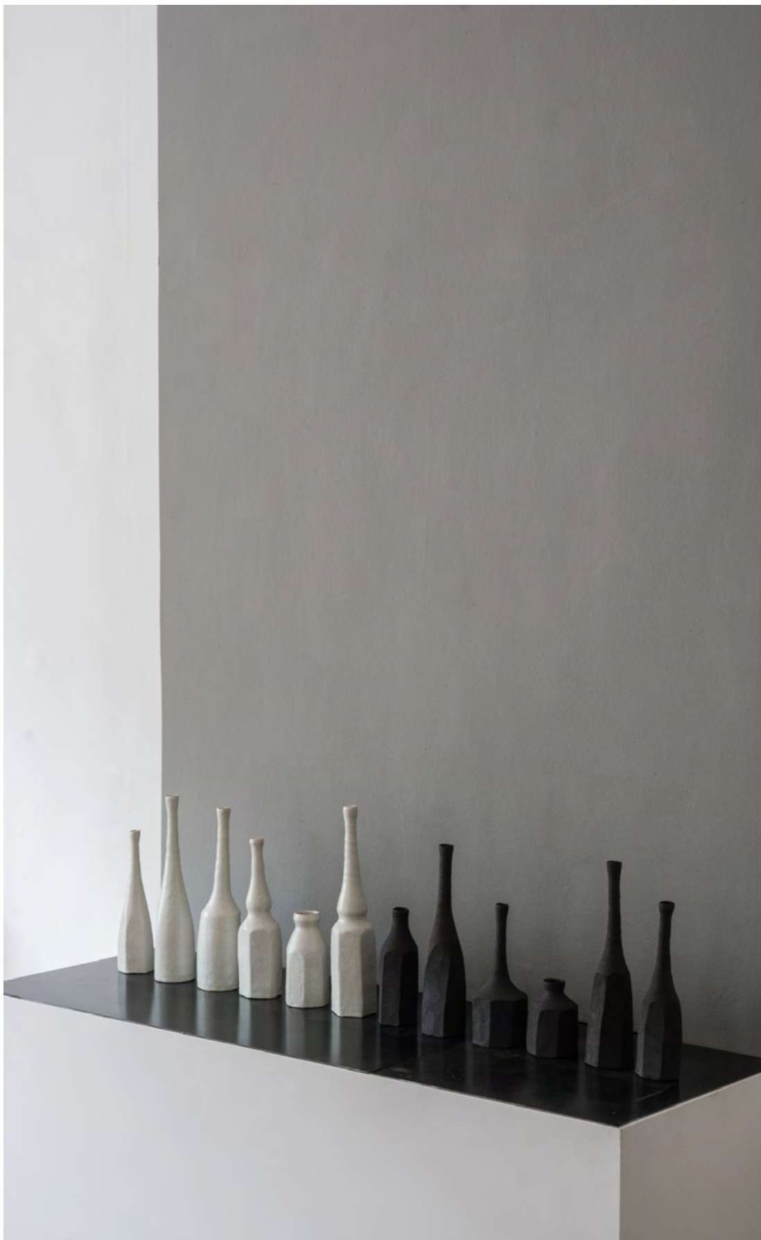
Akiko Hirai Still Life Bottles Sets (White and Black) 2022 Stoneware