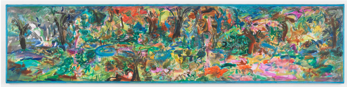
Jack Whitten, 'World's Longest Garden (Shalimar),' 1968

Hauser & Wirth's exceptional booth at Art Genève will showcase the gallery's multigenerational program and beyond, whilst celebrating forthcoming institutional shows from our diverse family of artists. The selection includes paintings, sculptures, works on paper and more from both contemporary and modern masters.