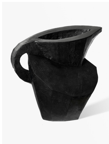
William Kentridge, 'Fill,' 2017