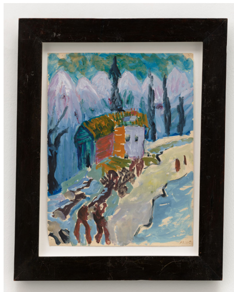
Marianne von Werefkin, Holzabfuhr in den Tessiner Bergen (Wood hauling in the Ticino Mountains), 1925-1929