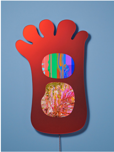
Pipilotti Rist, 'Marmelade Playhouse' (detail), 2024