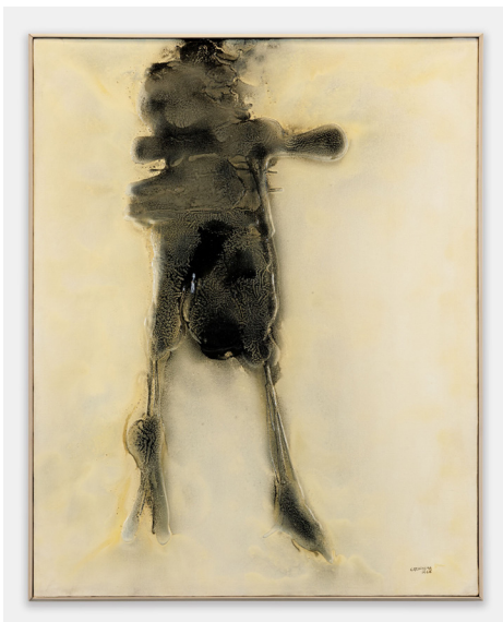
Carol Rama, 'Ohne Titel (Untitled),' 1968