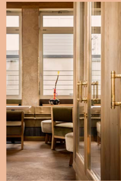
LOUNGE & BAR