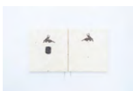
Hanna Umin Saccomazone Players , 2024 Wood, plaster filler, latex paint, oils, shellac, brass, epoxy clay, fingernail clippings 18 × 29 1/2 in (45.7 × 74.9 cm) HU24MM006