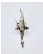
Hanna Umin Seraph , 2025 Found objects, cast resin, soldered brass, wire, epoxy clay, fingernail clippings 7 × 2 1/2 × 1 1/2 in (17.8 × 6.4 × 3.8 cm) HU25SC003