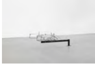
Bradley Marshall Waistline and Timeframe , 2025 Sand-blasted steel, stainless steel rigging wire, powder coated steel, high school ring, epoxy, plastic cup 45 × 29 1/2 × 15 in (114.3 × 74.9 × 38.1 cm) BM25SC001