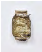
Hanna Umin Polynices , 2026 Found objects, cast resin, soldered brass 5 1/4 × 3 × 1 in (13.3 × 7.6 × 2.5 cm) HU26SC001