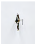
Hanna Umin Sphynx , 2026 Found objects, cast resin, soldered brass, nicotine tar 4 × 1 3/4 × 2 in (10.2 × 4.4 × 5.1 cm) HU26SC004