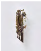
Hanna Umin Bathsheba , 2026 Found objects, cast plaster, cast resin, soldered brass 4 1/2 × 1 1/2 × 1/2 in (11.4 × 3.8 × 1.3 cm) HU26SC002