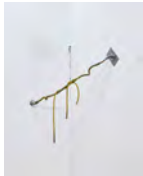
Montana Simone Corner Slapper , 2025 Steel, latex, corner, motor 32 × 32 × 12 in (81.3 × 81.3 × 30.5 cm) MS25SC001