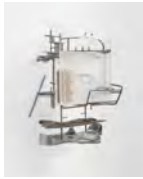
Bradley Marshall Rolltop Adherent , 2024–2025 Sand-blasted steel, bronze, aluminum foot measuring device, acrylic, vinyl film, sunflower seeds, hardware 18 × 15 1/2 × 12 in (45.7 × 39.4 × 30.5 cm) BM25SC002