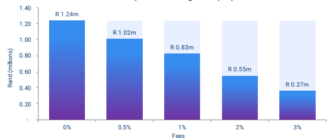
Impact of fees on after inflation value of R100,000 invested for 40 years earning 6.5% pa plus inflation 2

This graph shows the hypothetical 6.5% pa return above inflation.