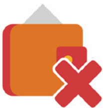
Wallets / Purses