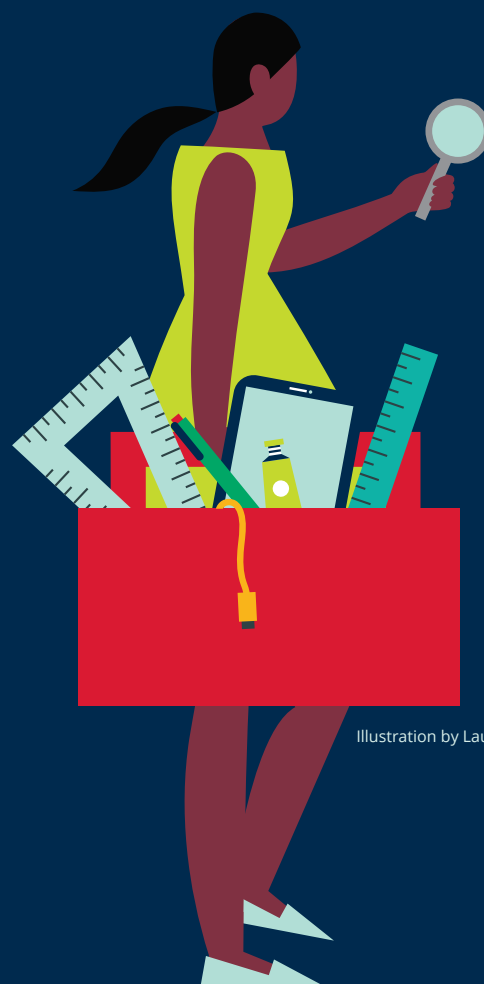
Illustration by Lauren Rolwing