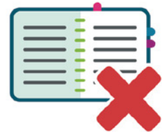
Books / Notes