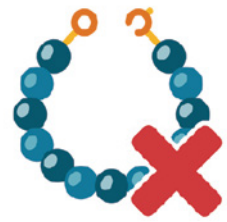
Jewellery thicker than ¼ inch (½ cm)