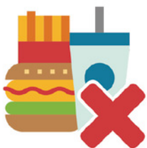
Eating / Drinking / Chewing gum