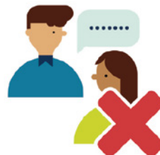
Chatting / Disturbing others