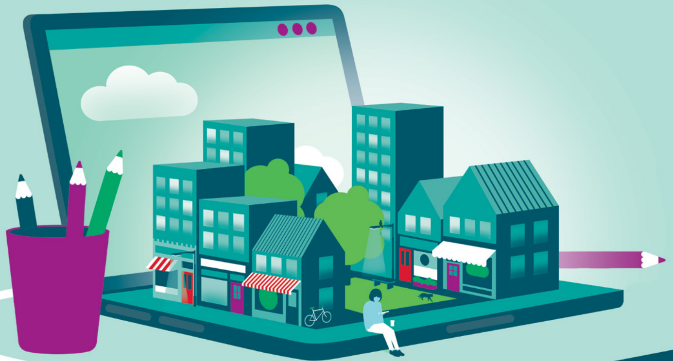
Illustration by Lucy Vigars