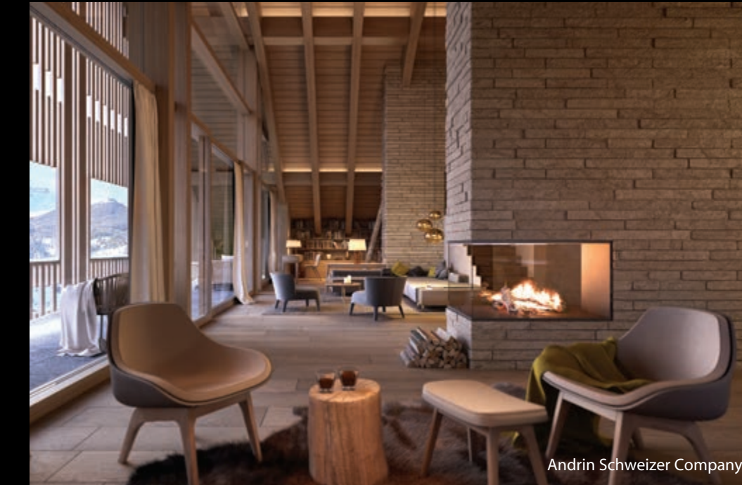
Andrin Schweizer Company