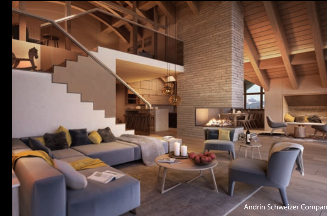
Andrin Schweizer Company

The Chedi Andermatt's penthouses are strictly limited in number.