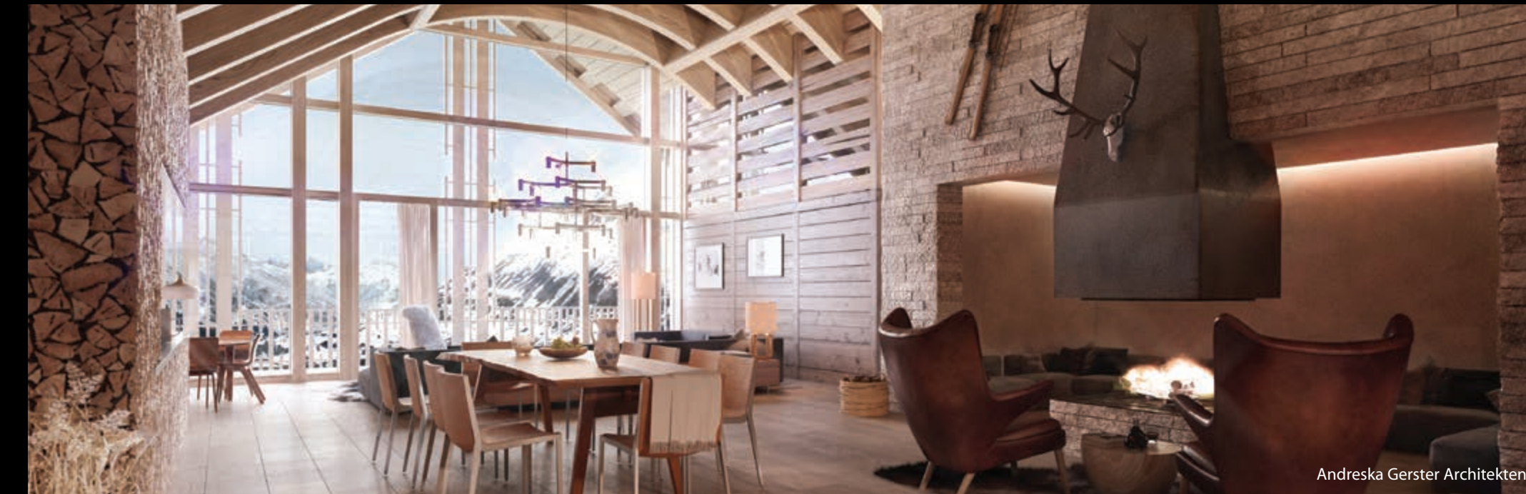
Andreska Gerster Architekten