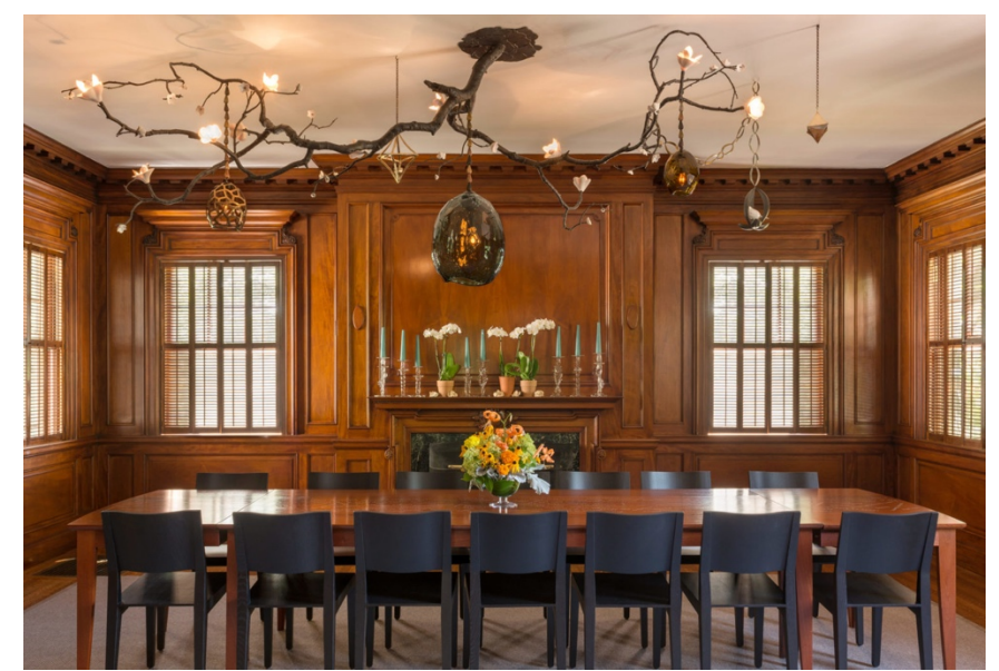
Collage Chandelier for Rhode Island School of Design, 2014. Bronze, porcelain, crystal, and glass. Nat Rhea

If you haven't heard of him, it's because his imagination often runs wild behind closed doors. He transforms clients' private residences into calming oases, bringing the outdoors in with magnificent, metal fireplace screens and sprawling, flowering branch installations that appear rooted in the architecture. To experience them is to be lucky enough to receive a personal invitation to these homes—or order a copy of Wiseman's eponymous new book (Rizzoli, available April 2020).