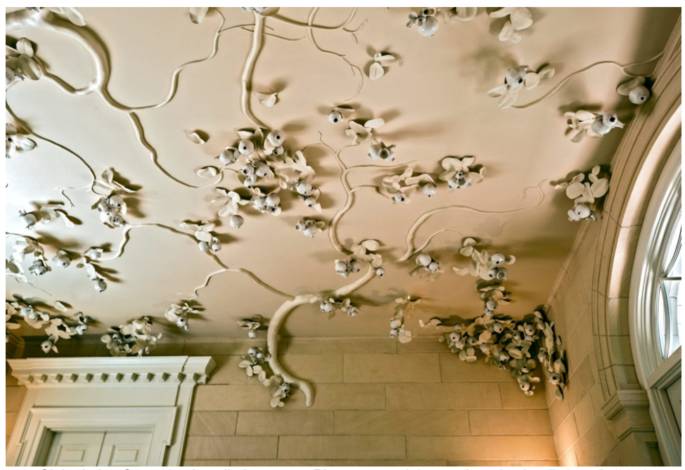
Cielo de las Granadas Installation, 2007. Plaster, porcelain, steel, and paint. Robert Polidori