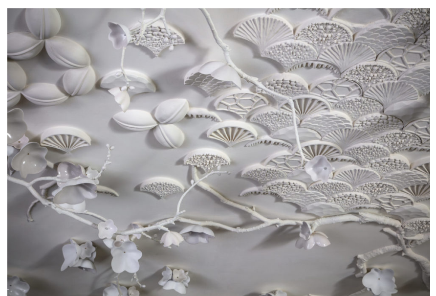
Pattern and Ornament Ceiling Installation, 2016. Plaster, porcelain, bronze, glass and paint. Joe Kramm

The tome doubles as a visual feast of pattern. "I have always been drawn to nature in my work," he says. "And within the natural world, magnificent patterns abound, from crystalline structures to honeycombs, and cell formations to ocean swells." His motifs transcend even these, calling on decorative wood carvings, mosque adornments and more across cultures and time periods.