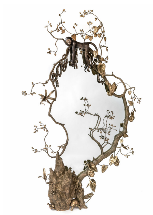
Lost Valley Mirror, 2019. Bronze and glass.

He has crafted ornate furniture, enchanting chandeliers, gilded chalices and embellished Dior handbags. His coveted creations take shape in porcelain, bronze, glass, stone and plaster. And up next, he tells us, is water: "I'm creating a large-scale exterior fountain wall, with bronze outcroppings, animal sculptures and areas for plants to grow amongst cascading water."