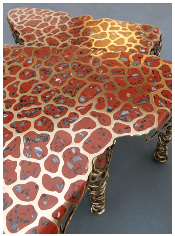
Water Jali Pattern Tables, 2018. Bronze and terrazzo with granite. Mark Hanauer