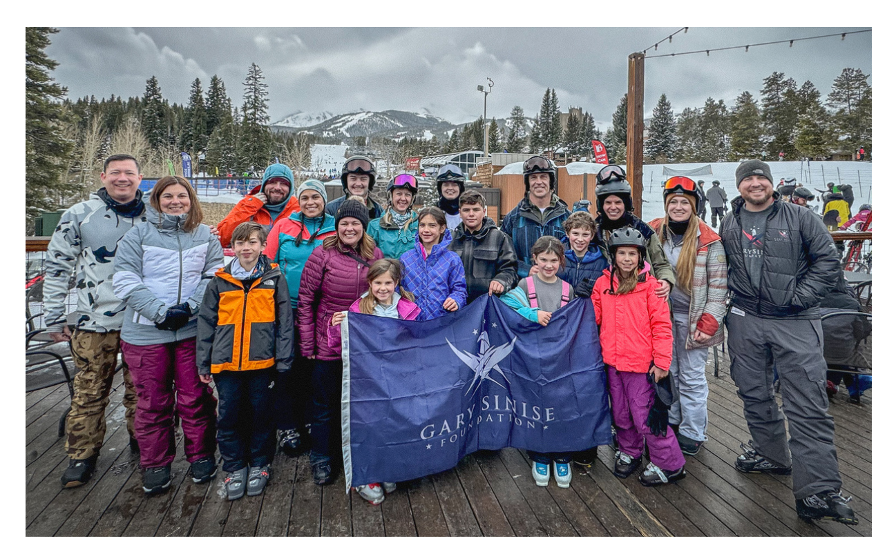
BUILDING COMMUNITIES OF SUPPORT