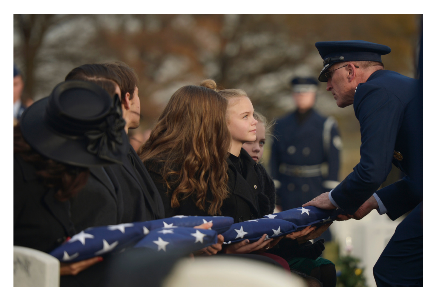
FROM THE DAUGHTER OF A FALLEN HERO, A GOLD STAR CHILD