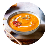
Savory (soup, sauce, seasoning)

Give your consumers a great taste, premium mouthfeel, and the nutritional benefits of dairy in their favorite products today.