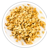
Dry Roasted Large Granules