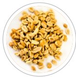
Dry Roasted Peanut Splits Organic Available

All products are custom, made-to-order , ensuring freshness and top quality ingredients.