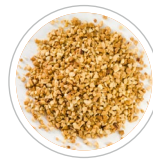
Dry Roasted Small Granules