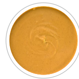
Peanut Paste/ Butter/Variegate