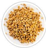
Dry Roasted Medium Granules