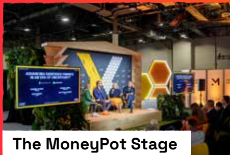
The MoneyPot Stage

NVIDIA hosted a summit in partnership with Oracle on GenAI in Banking and Fintech that covered the realities of what it takes to implement an innovative strategy around the most groundbreaking technology of our time.